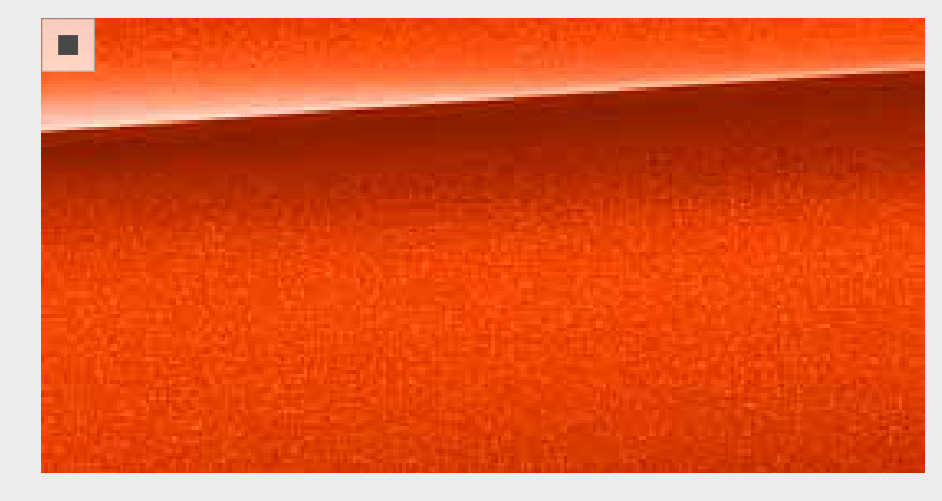
Metallic Sunset Orange