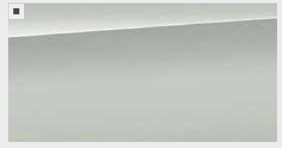
Metallic Hockenheim Silver