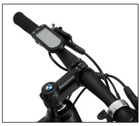
Fixed installed display and charge status display