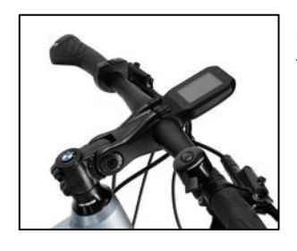
Display with connection to smartphone app