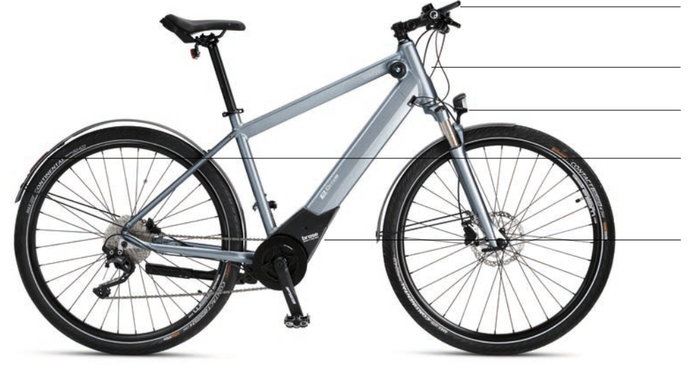
Charge status display